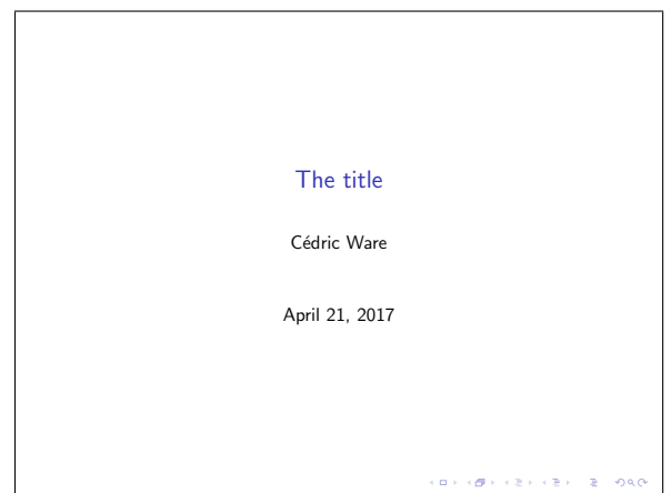
Figure 3: Disabling blocks for the title frame.