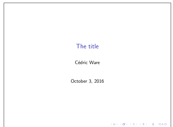
Figure 3: Disabling blocks for the title frame.