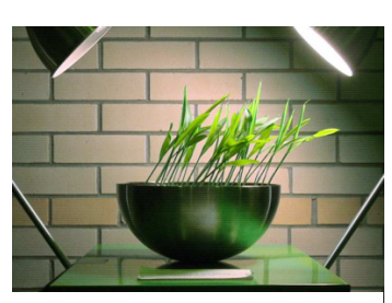
Fig 3. Group of living plants [5] for a visualization