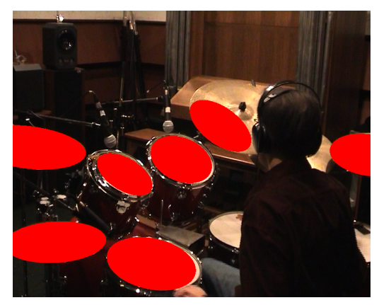
Figure 2: Example of drum top extraction

The video transcription process described in the previous sections produces, for each instrument class \mathcal{L}_j the sequence p_j^1(n) = p_{\phi^{-1}(j)}(n) of probabilities that this instrument is played at frame n. When the scene is recorded by more than one video camera, the analysis can be individually performed for each video stream. Additionally, an audio transcription system can also be used. If N_s