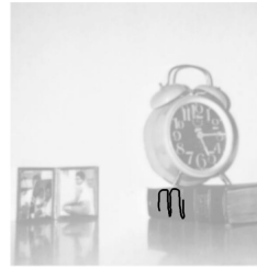
Fig. 1. Non Identifying Detection on a book edge. 10^{-3} -meaningful match.