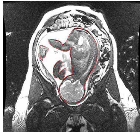
Fig. 1 Fetus outline traced on a slice of a 3D MRI data set.

From the image database, we segment the tissues playing an important role in dosimetry such as the uterus, the brain or the bladder. This has been done either manually for a number of data sets, or automatically, using the method described in [16]. An example of fetus segmentation on MRI data is shown in Figure 1.