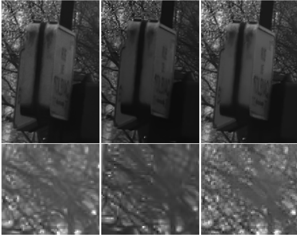
Figure 9: Real data. Left: Extracts from the NL-MEANS denoising of the normalized reference frame. Center: NL-MEANS denoising of the result by Sen et al. Right: Proposed non local approach. The proposed approach manages to better denoise the bright regions (see the street panel) while better preserving details on dark regions (see the tree branches). On the contrary, this is not the case for the two other examples. The denoising technique manages to remove part of the noise on the bright regions but at the cost of blurring the dark zones. Only the green channel irradiance is displayed in order to avoid contrast changes introduced by the tone mapping techniques (needed to display HDR color images) and better visualize noise level differences.