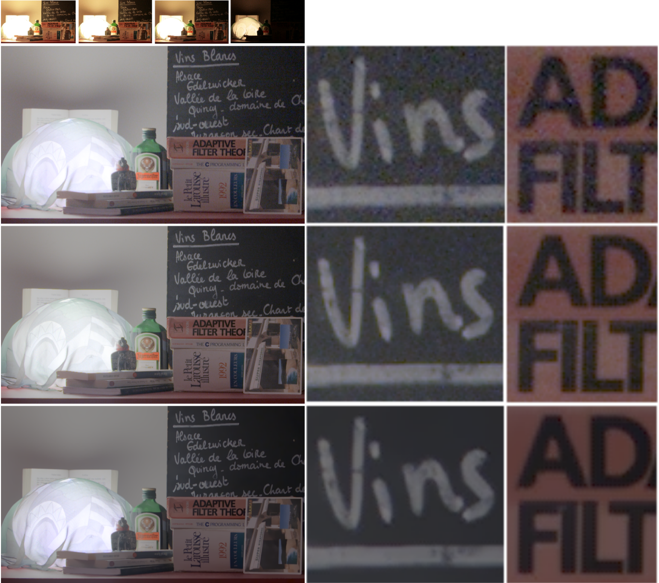
Figure 4: Real data. A static scene is acquired using a static camera. First row: Input images (JPEG version). Second row: Tone mapped reference image normalized by the exposure time. The saturated regions of the reference image were filled using the Poisson editing patch based approach described in Section 3.1.4. Third row: Tone mapped irradiance estimation by the MLE approach [10]. Fourth row: Tone mapped irradiance estimation of the proposed non local estimation approach. The result of the non local approach is less noisy than the one obtained using MLE. Thus releasing the alignment hypothesis does not have a significant impact on the algorithm performance. Recall that some demosaicking artifacts may appear due to the basic used technique. Please see electronic copy for better color and details reproduction.