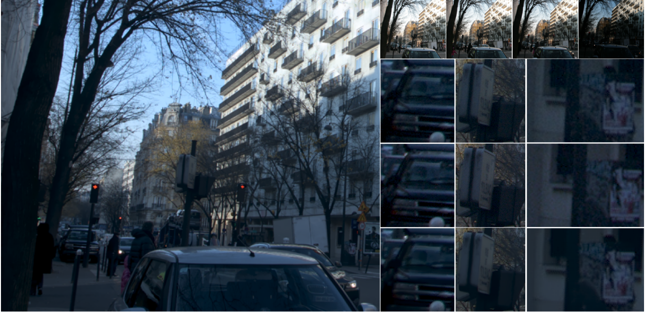
Figure 7: Real data. Dynamic scene (pedestrians in the street and moving cars) acquired using a hand-held camera. Left: Tone mapped irradiance estimation using the proposed non local approach. No ghosting artifacts appear. Right first row: Input images (JPEG version). Right second row: Extracts of the normalized reference image. Right third row: Extracts of the results by Sen et al. [26]. Right fourth row: Extracts of the results by the proposed non local approach. The result obtained by the proposed approach is significantly less noisy than the one by Sen et al. Please see the electronic copy for better color and details reproduction.