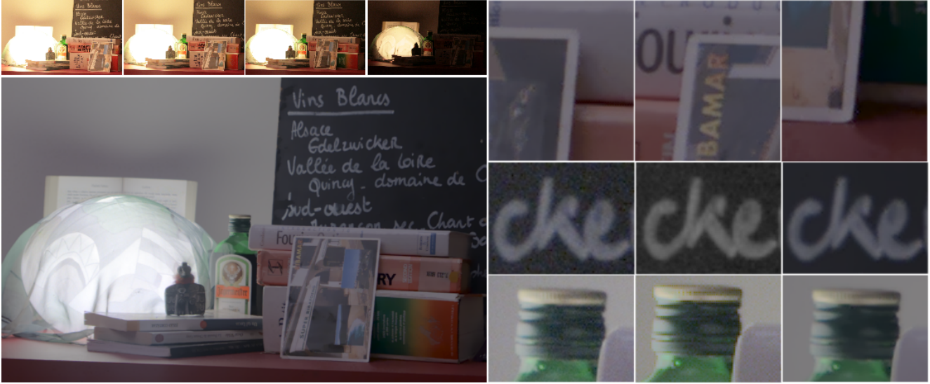
Figure 5: Real data. Static scene except for one moving object (the postcard) acquired using a hand-held camera. Left side. First row: Input images (JPEG version). Second row: Tone mapped irradiance estimation using the proposed non local estimation approach. Right side. First row: Extracts of the moving object (the postcard). No ghosting artifacts appear. Second / Third row: Extracts of the normalized reference image (left), the method by Sen et al. [26] (center) and the proposed non local approach (right). The irradiance estimation of the proposed approach is considerably less noisy than the one obtained using the reference frame only or the method by Sen et al. Please see the electronic copy for better color and details reproduction.

ing technique manages to remove part of the noise on the bright regions but at the cost of blurring the dark zones.