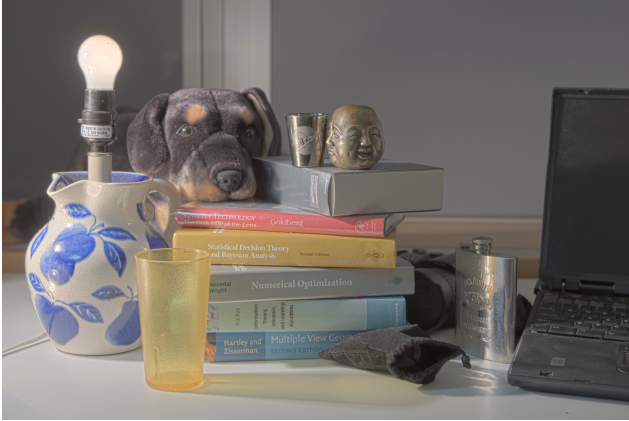
Figure 2: Tone mapped version of the HDR image used as ground-truth for the synthetic test presented in Section 4.1. From [13].