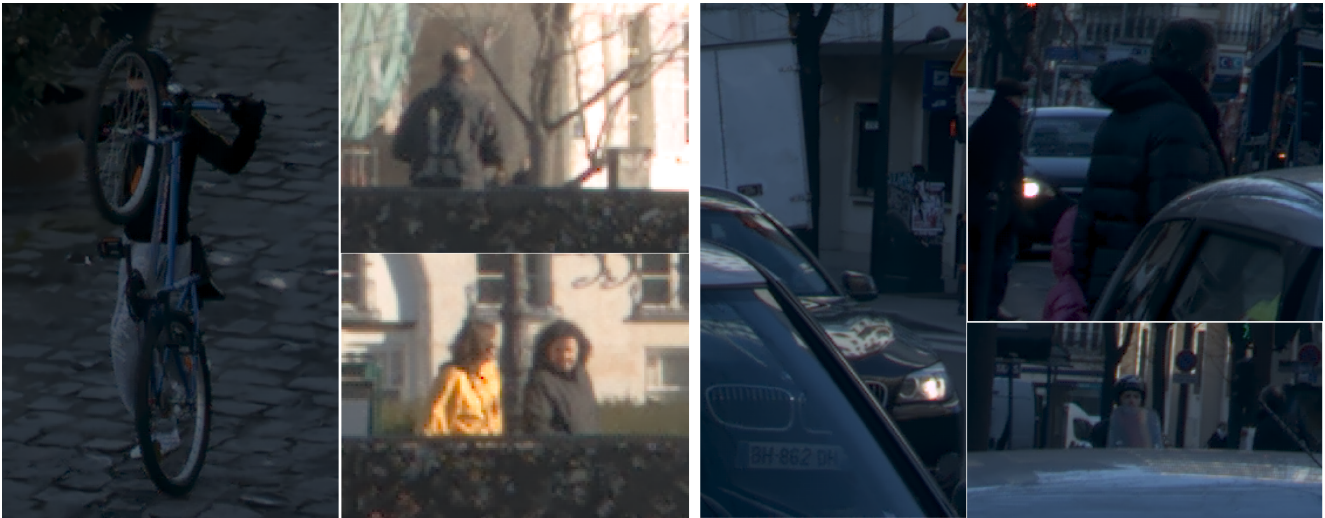
Figure 8: Real data. Extracts of the results obtained by the proposed non local estimation method for moving objects present on the scenes of Figures 6 (left) and Figure 7 (right). Notice that no ghosting artifacts appear in neither example.