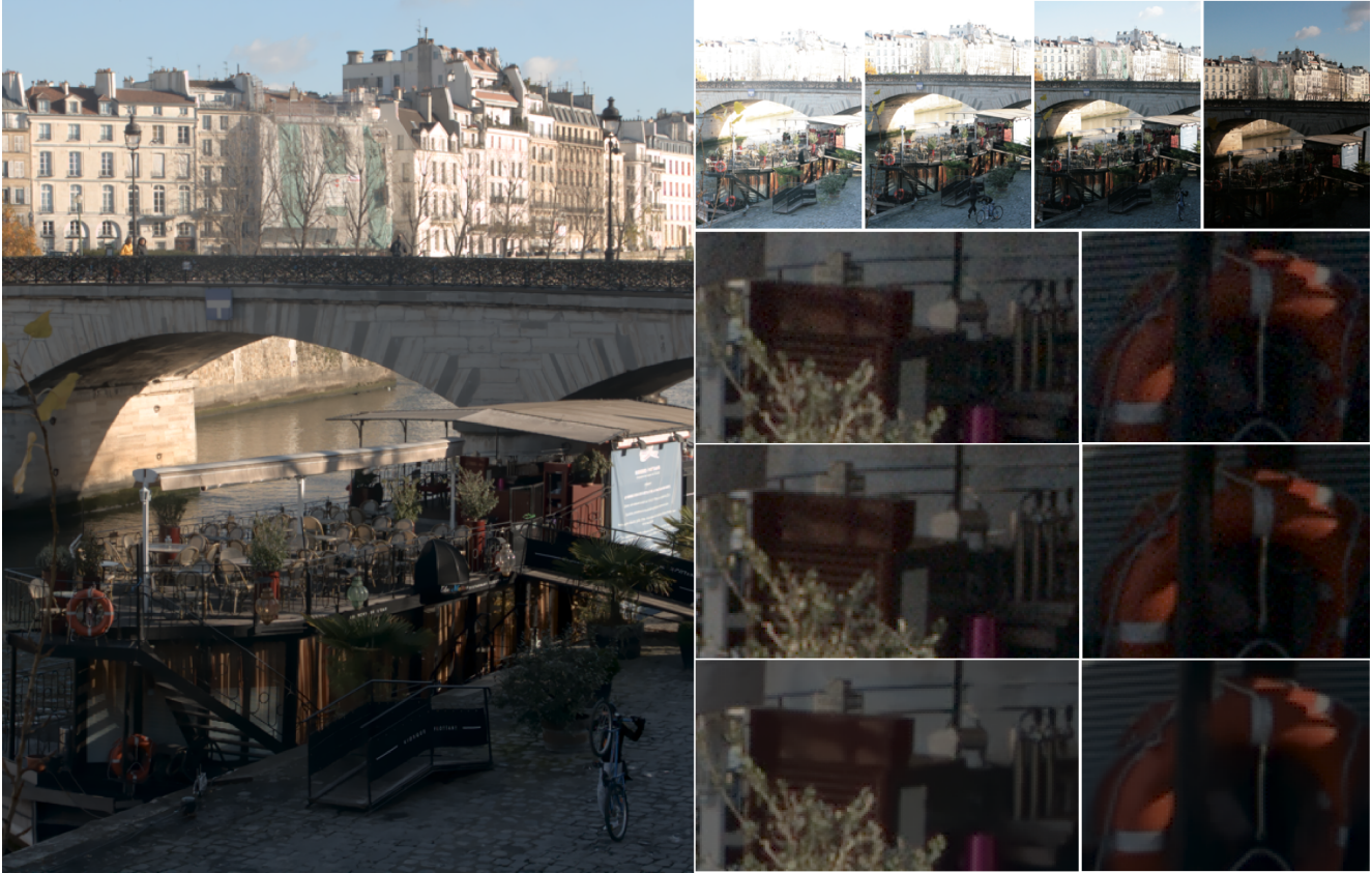
Figure 6: Real data. Dynamic scene (pedestrians in the bridge and people next to the boat) acquired using a hand-held camera. Left: Tone mapped irradiance estimation using the proposed non local approach. No ghosting artifacts appear. Right first row: Input images (JPEG version). Right second row: Extracts of the the normalized reference image. Right third row: Extracts of the results by Sen et al. [26]. Right fourth row: Extracts of the results by the proposed non local approach. The result obtained by the proposed approach is far less noisy than the one by Sen et al. Please see the electronic copy for better color and details reproduction.