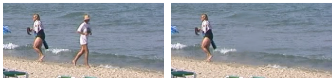
Original frame : "Crossing ladies"