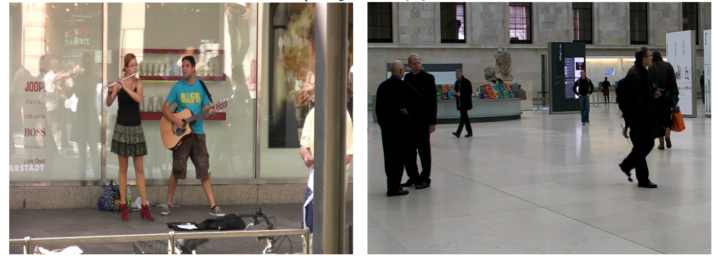
Our inpainting result