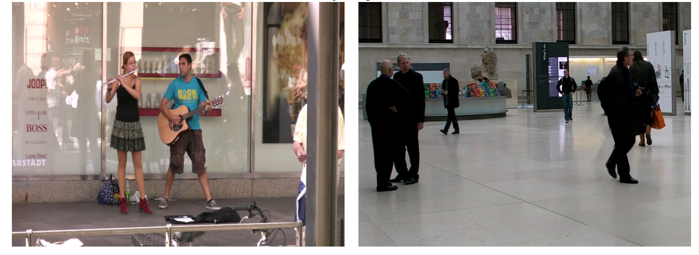
Figure 4: We achieve similar results to those of [14] in an order of magnitude less time, without user intervention. The occlusion masks are highlighted in green. Result videos are viewable at http://www.enst.fr/~gousseau/videoinpainting_cvmp