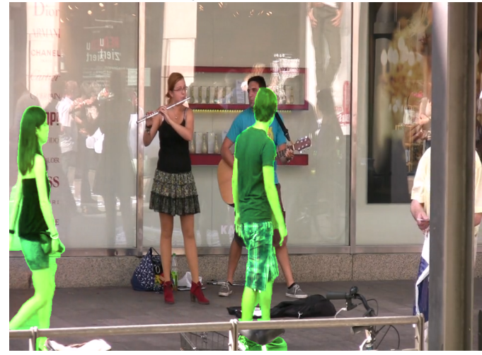
Original frame : "Duo"