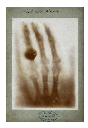
Figure 2: